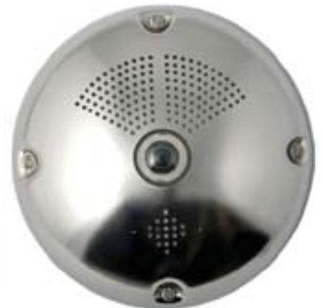
Q24 Standard Ø 160 mm Q24 Vandalism Ø 160 mm

Remote Monitoring Technologies be there from anywhere.